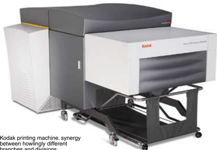
Kodak printing machine. synergy between howlingly different branches and divisions

Most of the products we consume are manufactured in another country, and behind the scenes of this manufacturing are global supply chains. In his book "The World is Flat", Thomas L. Friedman coins the phrase "supply chaining", which he describes as one of the flatteners of the world. "The more the supply chains grow and proliferate, the more they force the adoption of common standards between companies... The more they [the supply chains] eliminate point of friction at borders, the