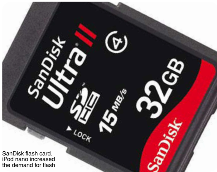
SanDisk flash card. iPod nano increased the demand for flash

big diversity of markets and products, made them focus on centering the manufacturing of the main runners in close proximity to allow greater flexibility for CM location and hubs for the other products.