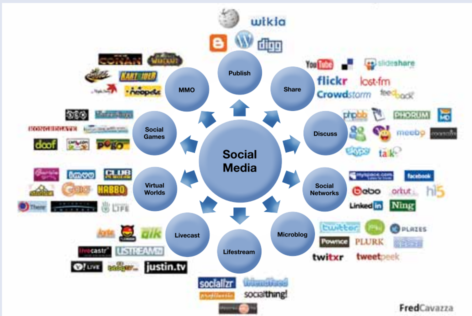
The social media landscape reflects the link between different social movements and the respective online portals supporting these movements.