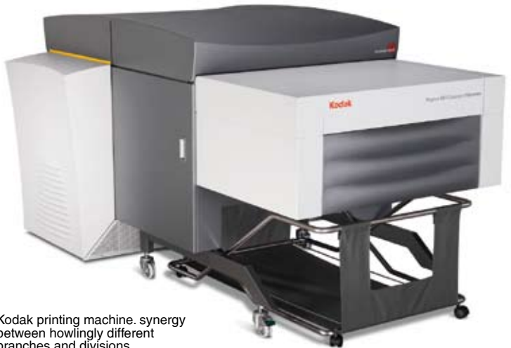
Kodak printing machine. synergy between howlingly different branches and divisions

The target for business today is the global markets. Mom & Pop shops and back-yard goat-cheese production facilities are relics of yesteryear. Most of the products we consume are manufactured in another country, and behind the scenes of this manufacturing are global supply chains. In his book "The World is Flat", Thomas L. Friedman coins the phrase "supply chaining", which he describes as one of the flatteners of the world. "The more the supply chains grow and proliferate, the more they force the adoption of common standards between companies... The more they [the supply chains] eliminate point of friction at borders, the